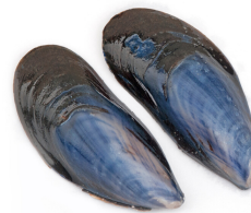
Blue Mussel Shell